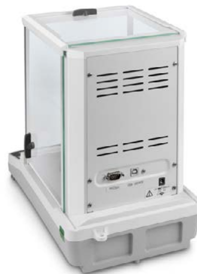
KERN ACS/ACJ with standard data interface RS-232 and USB data interface

The bestseller in analytical balances, with high-quality single-cell weighing system, also with EC type approval [M]